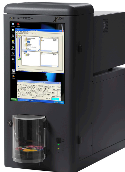
Dimensions 311W x 585D x 654H mm